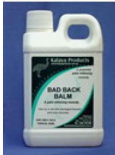
Bad Back Balm